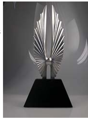
The new GLAAD Media Awards Statuette which was unveiled at the New York event, designed by Society Awards

Keith Olbermann received a standing ovation from the crowd when accepting the award for Outstanding TV Journalism Segment for "Special Comment: Gay Marriage is a Question of Love" which aired on Countdown with Keith Olbermann on MSNBC. Olbermann cited that his presence in the media had an advisor of John McCain change his stance on marriage equality. "One down," Olbermann said- eliciting laughs and applause from the crowd.