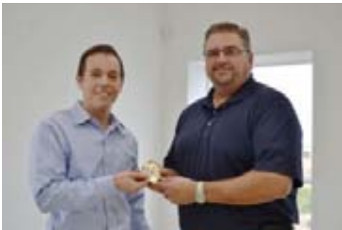
Peggy Kiefer / Grove Sun

Posted: Wednesday, December 5, 2012 4:13 pm | Updated: 10:54 pm, Wed Dec 5, 2012.