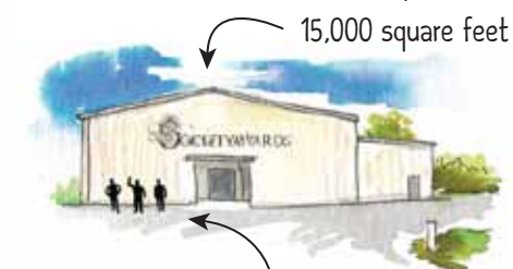
15,000 square feet

In 2012, he built a warehouse in Grove for his growing company. He also makes awards for MTV, "The Voice" and the Emmy awards.