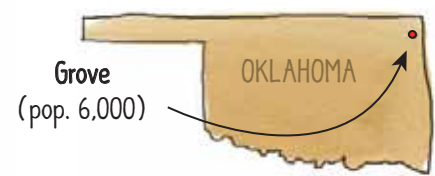
Grove (pop. 6,000)