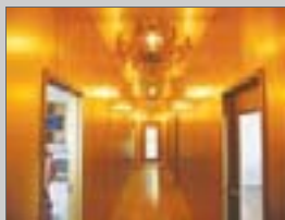
The Golden Hall at Society Awards in Grove.