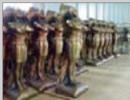
These Point of Purchase Association International Awards are lined up to be finished in the detailing room at Society Awards in Grove.