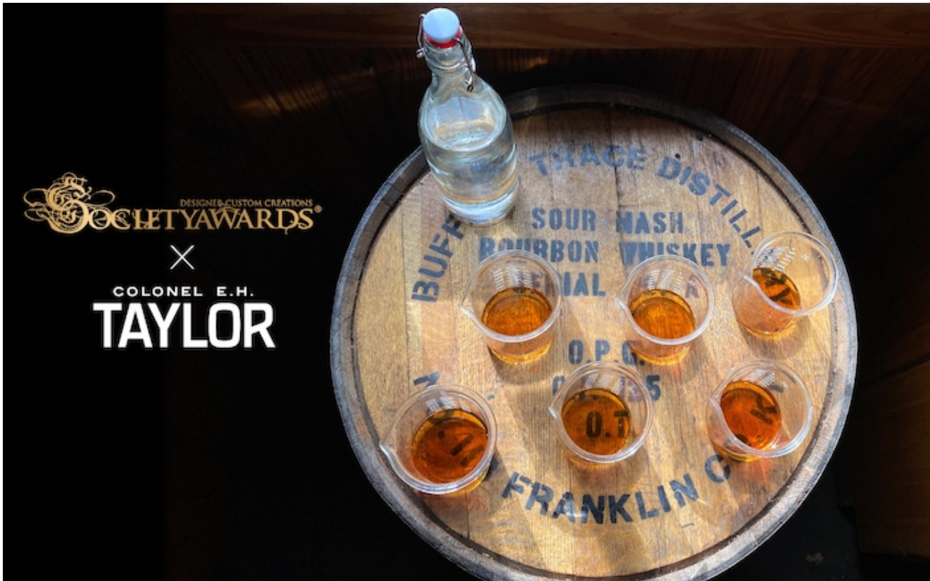
A final tasting of select E.H. Taylor barrels before selecting the barrel.

Their second project with Buffalo Trace was something the distillery had never allowed for a private client. Society Awards officials explained that the original barrel they purchased was “so special,” that they were able to ship it to Jalisco, Mexico to have a second life aging a fine añejo from Corazón Tequila ... another Buffalo Trace brand. This innovation is now offered to all Buffalo Trace single barrel select clients.